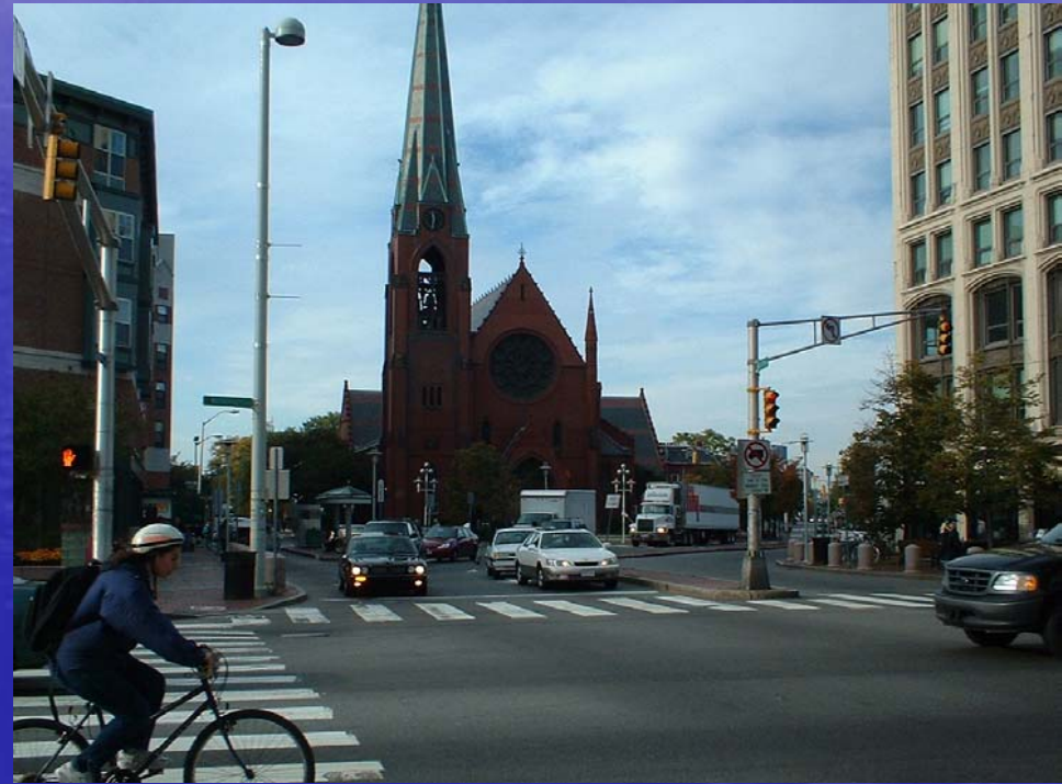
Central Square today